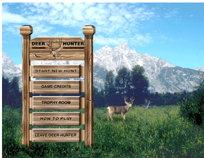
Figure 1: The opening screen of the game includes the option to start a new hunt or to look at your top five kills. The placement of the credits button is odd

Myst is no longer the number one selling PC game in the US; it has been replaced by Deer Hunter , a hunting simulation game. An add-on to the game, "Extended Season", is currently at number two. However, my interest in the game was not piqued by this fact, or by an interest in deer hunting, which I've never been a fan of. I became intrigued when a colleague claimed that game players would sit in front of their computer for hours waiting for deer to come along. I imagined, impossibly, players down on their bellies, staring intently at the computer screen, waiting for a 12-point buck to pass their way. Such a striking claim deserved a closer look, so a few weeks ago I bought the game and tried it for myself.