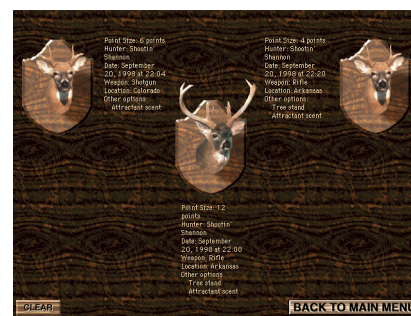
Figure 8: My trophy room; the visual metaphor is a bit overwrought

Regardless of whether this instance is successful, I think it shows that we could become much more sophisticated in how we use the element of time – and sound and rhythm – in interaction design to affect peoples experience with software. The producers of Deer Hunter do deserve credit for thinking about how these could be used to support the user experience of virtual hunting, and they have thought beyond the most obvious part of the interaction – shooting – to the other things that make hunting what it is: the nature, the sounds, the waiting, and even the presence of a laconic hunting buddy. Sensitive visual interface designers should be able to understand how different types of interaction and experience require different types of visual, aural, and conceptual aids.