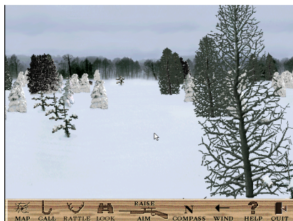
Figure 5: Winter in Indiana; the control bar is at the bottom

You have finally arrived on the scene of your chosen hunting spot (figure 5).