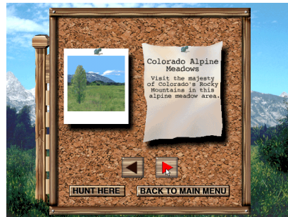
Figure 3: Choose your hunting spot. The game has four options; add-ons provide additional hunting spots

screen from where you can choose the locale of your desire: winter in Indiana, a Colorado alpine forest, or autumn woodlands in Arkansas (figure 3). You can also choose to engage in