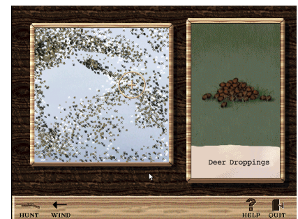
Figure 4: Map view of the hunting terrain; the screen real estate is not used very effectively

The first screen for the hunt is a map of the terrain. The interaction is extremely awkward here; the idea is to tramp around the map using a sighting scope until you find some signs that animals are in the area (these include droppings, bedding areas, and tree rubbings). Using the mouse to locate the scope, you click in a new destination, then click again to simulate walking (along a straight path) to that location. When you arrive, if there are any animal signs there, a rather boring representation appears in the window to the right (figure 4). This way of moving