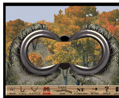
Figure 7: The binoculars don't actually help you see better

what poorly, and this seems most influenced by the graphics, which are criticized as being too sterile and flat. However, I think these criticisms need to be looked at relevant to the business objectives of the game (keeping the hardware requirements and game price low) as well as the type of experience it wants to simulate. Deer hunting as an activity is far more temporal in terms of hiding and waiting, and technically, the visual component only needs to support this enough to maximize this kind of interaction and experience. Perhaps 3D graphics and fancier scenes would be nice (perhaps – 3D always disorients me, and I don't always like the aesthetics of most 3-D worlds), but in terms of playing the game, they wouldn't necessarily add anything toward helping you succeed. There is an issue, however, mentioned earlier, about finding a more elegant way to move without using the map interface, but this doesn't necessarily require a full 3-D interface. This may be in contrast to such games as Dungeon , which, although it was successfully and engagingly played via command line interface, was enhanced by the addition of richer graphics because they provided more opportunities to place and manipulate objects, like coins, rings, swords, etc.